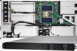
INTEL 1U, 4x GPU Server