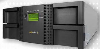
actLib 4U LTO Library