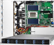
1U All-Flash AMD EPYC Storage Server